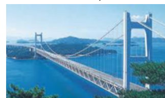
Seto Ohashi Bridge