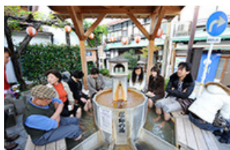
Public Footbath "Yakushi no Yu"

Institute for Planetary Materials, Okayama University Misasa Onsen Environment and Society (Session 5)