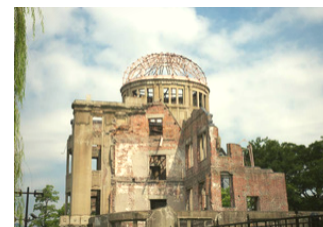
Hiroshima Peace Memorial

Cultural Experience Program (Optional) Individual Trip (Optional)